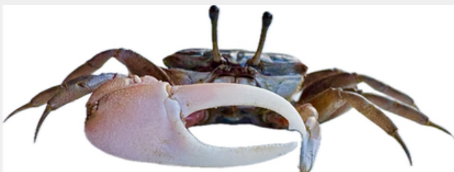
Cranuca inversa (male)

One of the key highlights was the rediscovery of the fiddler crab Cranuca inversa in Durban Bay. This species had not been recorded in the region since Kingsley's note in 1880, making the observation a particularly significant contribution to local mangrove biodiversity knowledge. Alongside target crab species, the camera systems also captured a range of non-target organisms, including the Mangrove Whelk ( Terebralia palustris ) and the silver-lined mudskipper ( Periophthalmus argentilineatus ). These records provide a broader snapshot of the species using and moving through mangrove habitats.