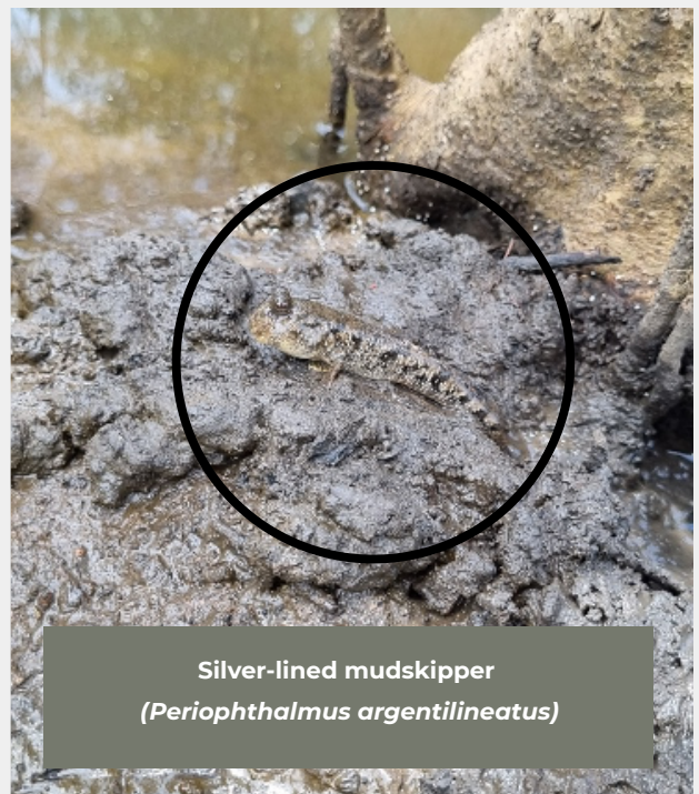
Silver-lined mudskipper ( Periophthalmus argentilineatus )

The South African team also deployed AudioMoth recorders to document acoustic activity within these systems. This adds another layer to the monitoring approach by allowing researchers to detect species presence and ecosystem activity through sound. Together, the camera and acoustic observations show how GLOW's methods can generate rich biodiversity insights while minimising disturbance to sensitive mangrove environments.